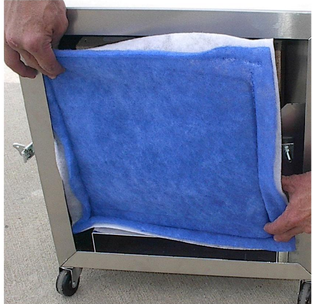
Fig. 3 Ring Panel Filter