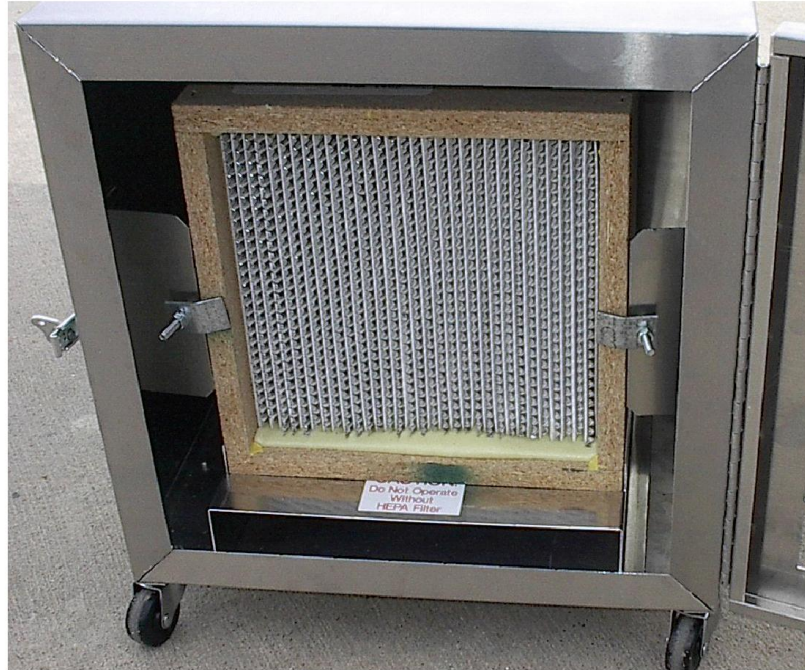
Fig. 4 HEPA Filter